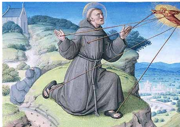
St. Francis Receives the Stigmata , from the Book of Hours of Henry VIII .

This morning when I did chapel for the 4-year-olds from the preschool I put on my trusty wolf hat (I bought it from the Top of the World Store on the Beartooth Highway) and told them the story of the Wolf of Gubio. The wolf was apparently old and could no longer run down speedy game and so fed on people. The legend is that St. Francis tamed him and told him not to eat people. St. Francis also told the townspeople they had to feed the wolf. A note in my source says that wolf bones were found in an excavation of the old Franciscan cemetery.