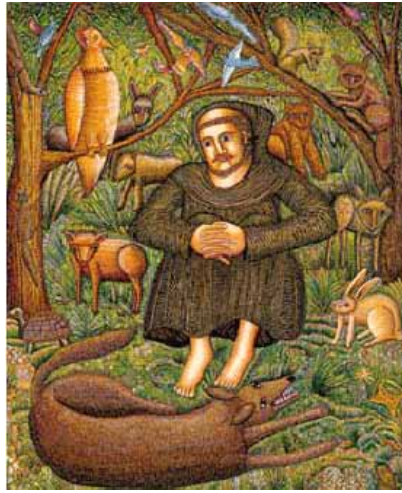
St. Francis and Brother Wolf

Tomorrow is the feast day of St. Francis of Assisi, (1226 A.D.) Francis has been called the “most admired and least imitated” of all the saints. There were many monastics who lived lives of extreme asceticism but St. Francis in his popularity is the one to make many people aware of this rather common facet of historical Christianity. Ghandi, in his famous definition of the seven deadly sins as he saw them (“wealth without work, pleasure without conscience”) included “religion without sacrifice.” In our misguided helpfulness we often try to make things so easy and free of cost that no one values them.