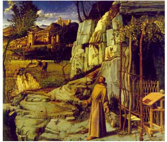
Giovanni Bellini's St. Francis in Ecstasy , 1475-80

The story of St. Francis is quite well known and movies have been made about him, most famously Franco Zeffereilli's 1972, Brother Sun Sister Moon which featured the enduring music of Donovan. There is a St. Francis of Assisi Omnibus of Sources (1900 pages) that I have in my library. It contains most of the sources of the life of St. Francis, and is well worth having. Although St. Francis attempted to live a simple life, he was far from a simple man. People then, as now, prefer unthinking good to intelligent good. St. Francis often reacted to situations in ways that astounded people, even those who knew him. He kept before him the person and kingdom of Christ and labored to assure nothing stood in the way of either.