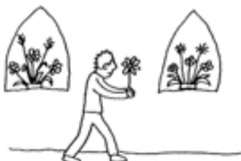
A DAY'S HARD LABOUR ON THE CHURCH FLOWER ROTA