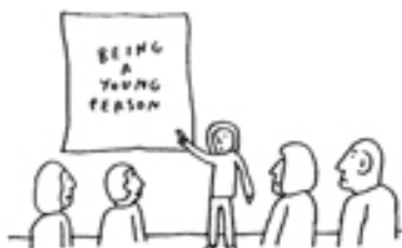
DOING A TALK AT THE CHURCH GROUP FOR SLIGHTLY OLDER PEOPLE