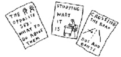
PROVIDE THEM WITH SOME INFORMATIVE PAMPHLETS