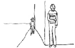
HAVE A MEMBER OF THE CHRISTIAN UNION INTERCEPT THEM