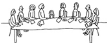
ATTENDING AN ENTIRE MEETING OF THE CHURCH COUNCIL

A PORTFOLIO OF SANCTIONS FOR YOUNG PEOPLE WHO COMMIT MISDEMEANOURS AT THE CHURCH YOUTH CLUB