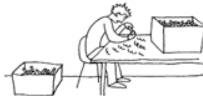
COMMUNITY SERVICE IN THE SUNDAY-SCHOOL PENCIL-SHARPENING DEPARTMENT