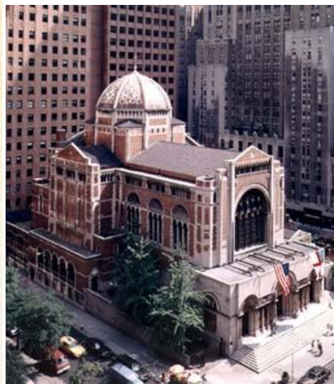
St. Bart's in New York City